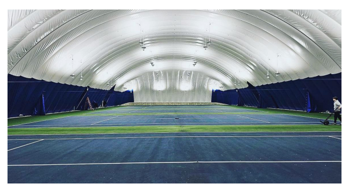
Ancaster Tennis Club (Manufacturer: The Farley Group)

Insulated fabrics and powerful heating and air-conditioning units provide ideal playing conditions year-round