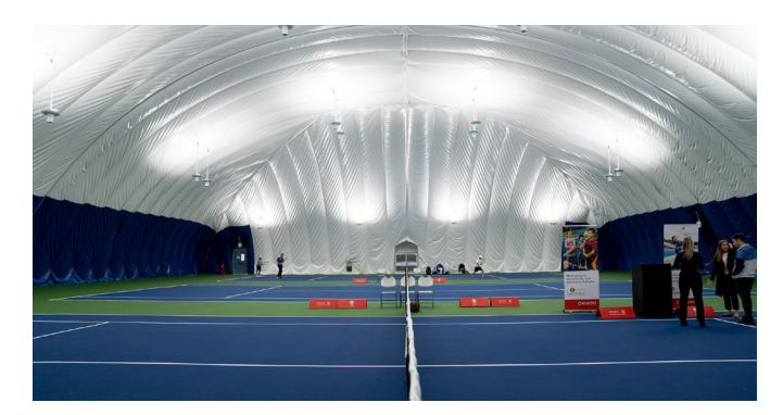
Premier Racquet Club Markham (Manufacturer: The Farley Group)

Most cost-effective building system available when it comes to covering large, clear span space.