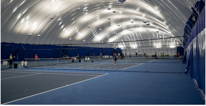
6-court dome at Marilyn Redvers Tennis Centre (Manufacturer: The Farley Group)