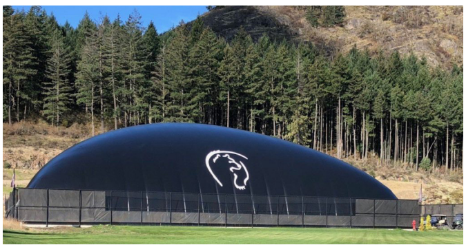
4-court dome - Bear Mountain Tennis (Manufacturer: The Farley Group)

Can be erected over virtually any existing tennis facility, regardless of the location or orientation of the tennis courts