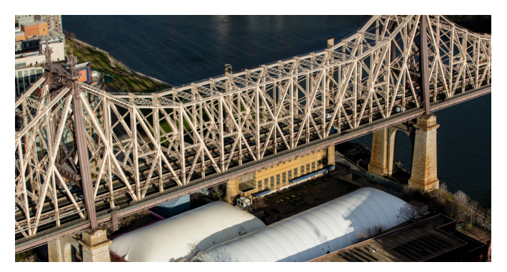
4-court and 7-court domes - Roosevelt Island Tennis (Manufacturer: The Farley Group)

CUSTOMIZABLE Can be built to any size and the outer fabric comes in several colours