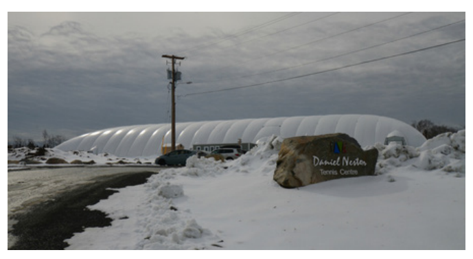
6-court permanent dome - Atlantic Training Centre (Manufacturer: The Farley Group)