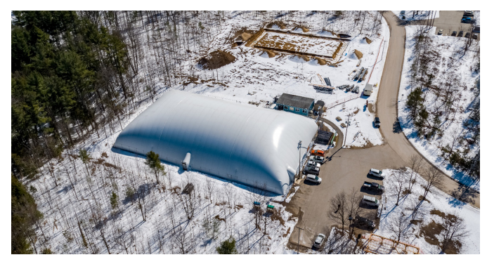
4-court seasonal dome - Barrie North Winter Tennis (Manufacturer: The Farley Group)

Insulated fabrics and powerful heating and air-conditioning units provide ideal playing conditions year-round