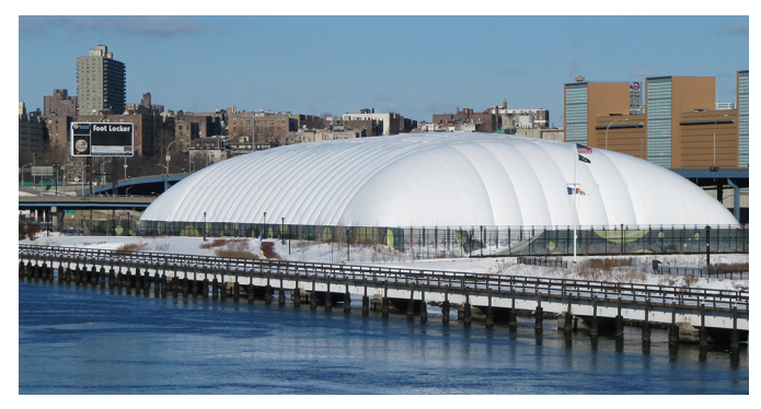
12-court dome - Stadium Tennis Center at Mill Pond, LLC (Manufacturer: The Farley Group)

Can be erected over virtually any existing tennis facility, regardless of the location or orientation of the tennis courts